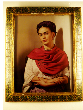
"fotografia Kahlo"